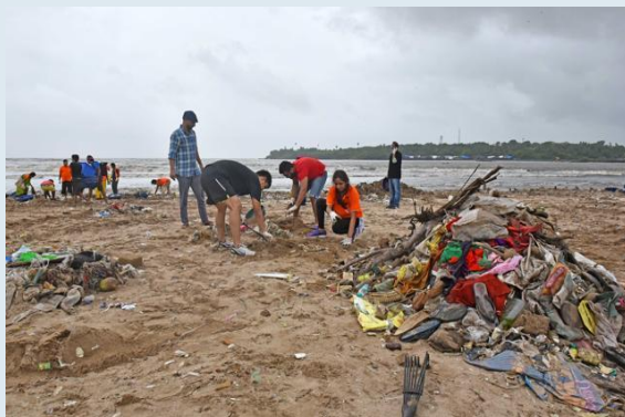
Photo of a load of plastics in the gut of a shark that washed ashore galvanised 300 youth to act

✚ It's the fish that launched many beach cleaners. The image of plastic all twisted up in the belly of a dead shark that washed ashore has become a catalyst for a massive beach cleaning movement in the fishing villages of north Chennai.